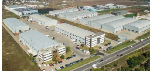
Karl Heinz Dietrich Otopeni, Brasov, Sibiu, Jucu 5 x10.000 m2 Roof, facade, curtain walls, steel structures