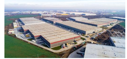
P3 Logistic Bucuresti Area: 60.000 m2 WH05,WH07,WH08 Roof, facade, skylights