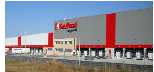
Kaufland Logistic Ploiesti, Turda 96.000 m2 Roof, facade, FR partitions, steel structures, curtain walls, cooling rooms