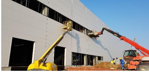
CTP Park BUW 16 (A1 Km 23) 80.000 m2 Roof, facade, curtain walls, steel structures

Our clients represent a wide range of industries, logistics and retail. We are proud that a significant part of our business comes from repeat clients. Our portfolio includes more than 1.000 projects. Below some examples: