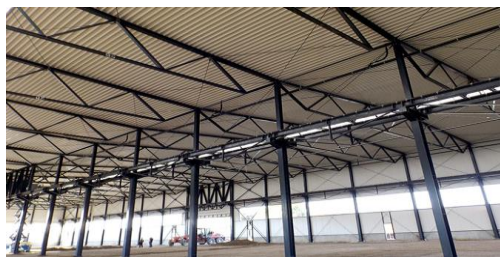
Salzgitter Giurgiu 8.000 m 2 Roof, facade, steel structures