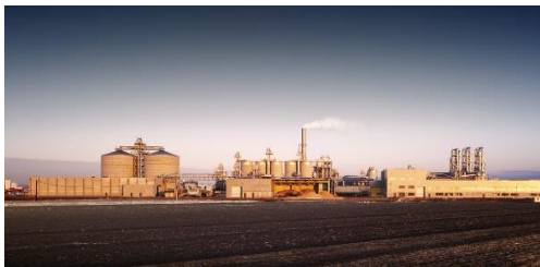
Egger Radauti 70.000 m 2 Roof, facade, industrial windows