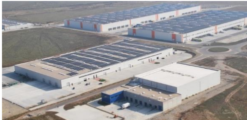
Westpark Ploiesti 120.000 m2 Roof, facade, FR partitions, steel structures, curtain walls