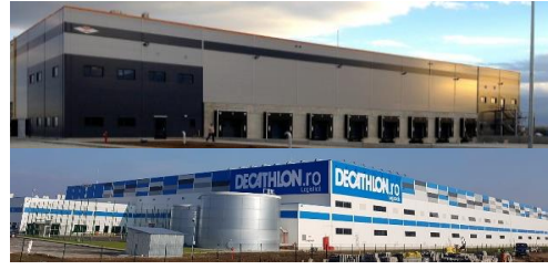
WDP Stefanesti, Oarja, Coldlea, Ploiesti 50.000 m2 Roof, facade, FR partitions, curtain walls, aluminim facade