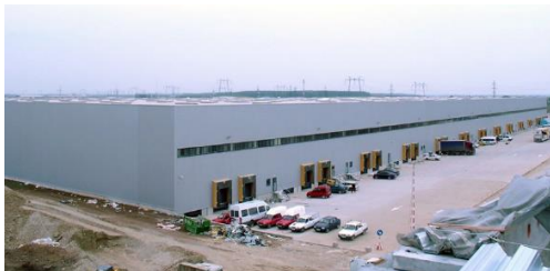
Cefin Logistic Park Bucuresti, Arad 80.000 m2 WH00,WH01,WH02,WH03,WH04,WH12 Roof, facade, FR partitions, steel structures, cooling rooms