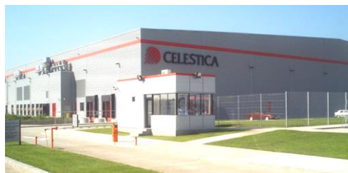
Celestica Oradea 18.000 m 2 Roof, facade, steel structures