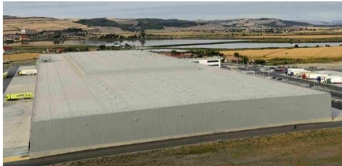
Lidl Logistic Ploiesti, Chiajna, Iernut 120.000 m2 Roof, facade, industrial windows, steel structures, FR Partition, cooling rooms