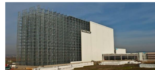
Macromex Campia Turzii 10.000 m 2 High Bay cooling room, roof, facade