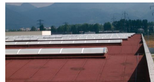
Italsofa Baia Mare 56.000 m 2 Roof, skylights

We offer complete services from design to execution, from finding optimal solutions for your project to delivery project in agreed terms, from finding cost efficient solution to financing your project. Because building efficiently means finding the optimal path from your idea to your project by means of our building experience.