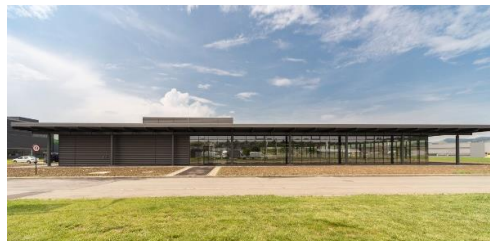
BOSCH Blaj 2.000 m 2 Roof, facade, curtain walls, steel structure