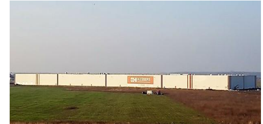
H.Essers Bolintin 39.000 m2 Roof, facade, steel structures, curtain wall